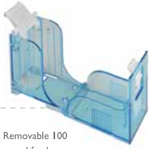
Removable 100 card feeder