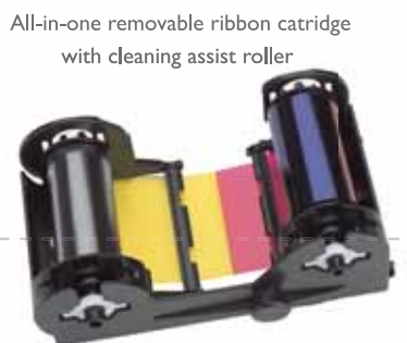
All-in-one removable ribbon cartridge with cleaning assist roller